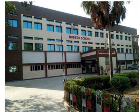
Modern School Faridabad