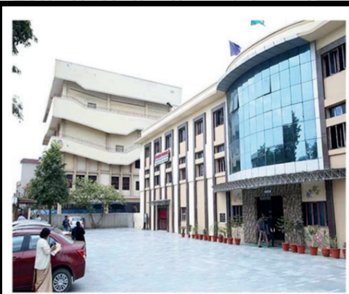
Modern School Noida