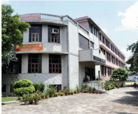
Modern School Vaishali