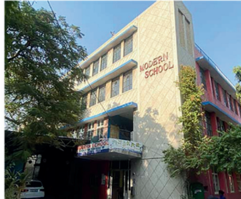
Modern School Junior Wing